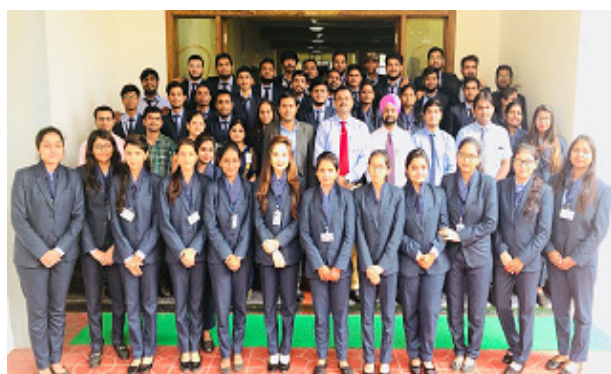
Participants with the Trainer & Faculties at IMR