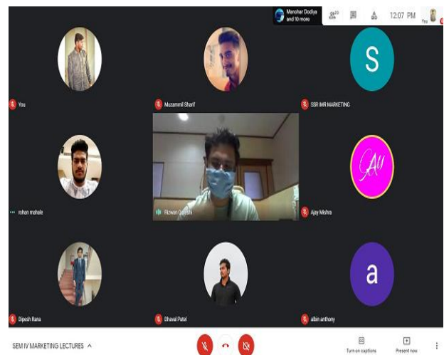
Feedback on Presentations in Progress