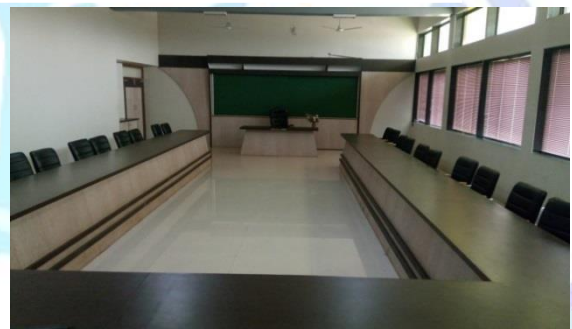
Conference Room at IMR