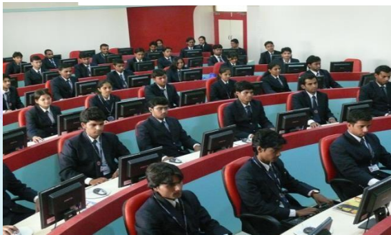
IMR Computer Lab