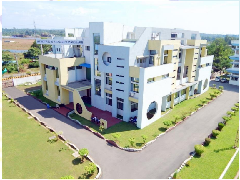
SSR IMR Campus