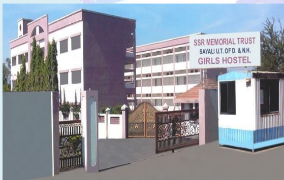
Girls Hostel at SSR