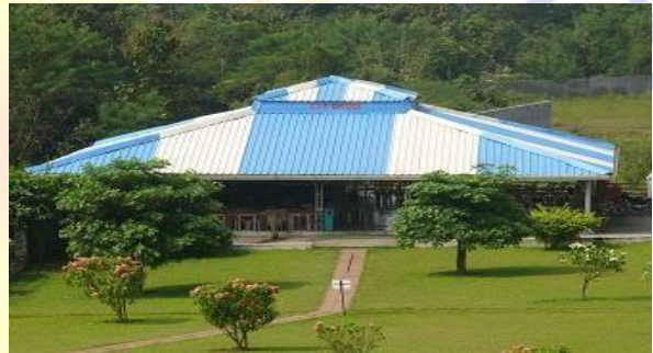
Canteen at SSR