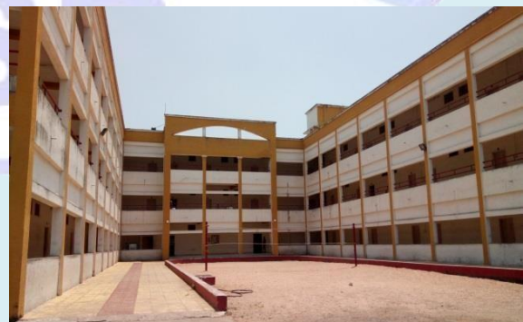
Boys Hostel at SSR