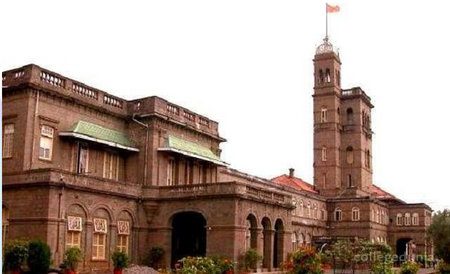
Savitribai Phule Pune University, Pune

SSR INSTITUTE OF MANAGEMENT & RESEARCH, SILVASSA