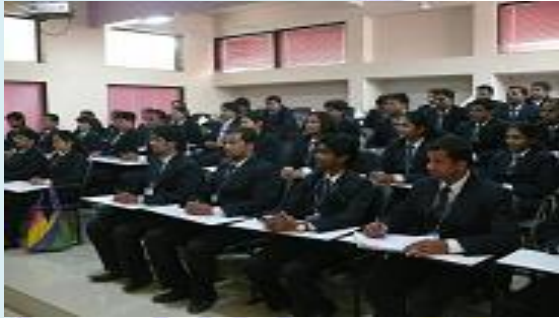
Class Room at IMR

The academic block has assertions of auditorium, Conference Hall, and spacious classrooms accommodating 60 students at one time and is access equipped with the latest Technology, Computer lab with upgraded technological facilities. Spread over 50 acres of lush green campus along with well-furnished hostels and administrative building provides the apt homely ambience for high intellectual pursuit