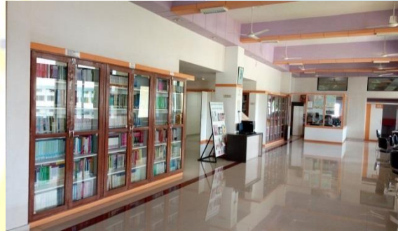
Library at IMR