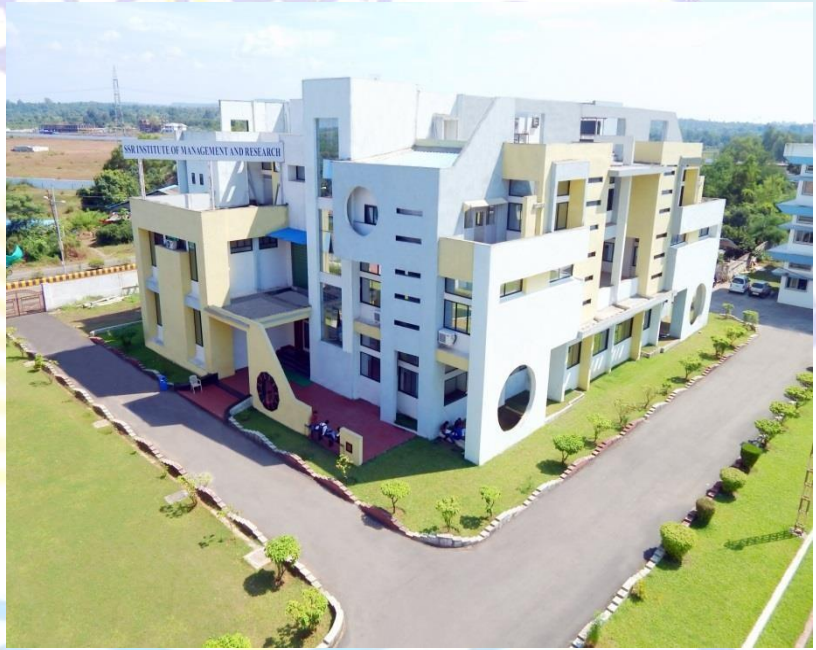
SSR IMR, Silvassa Campus