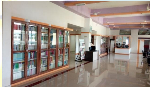
Library at IMR