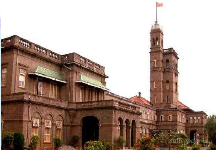
Savitribai Phule Pune University, Pune