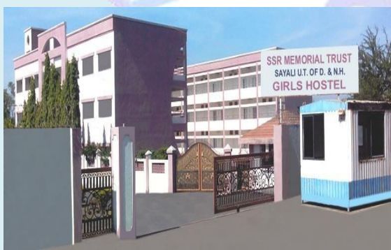
Girls Hostel at SSR