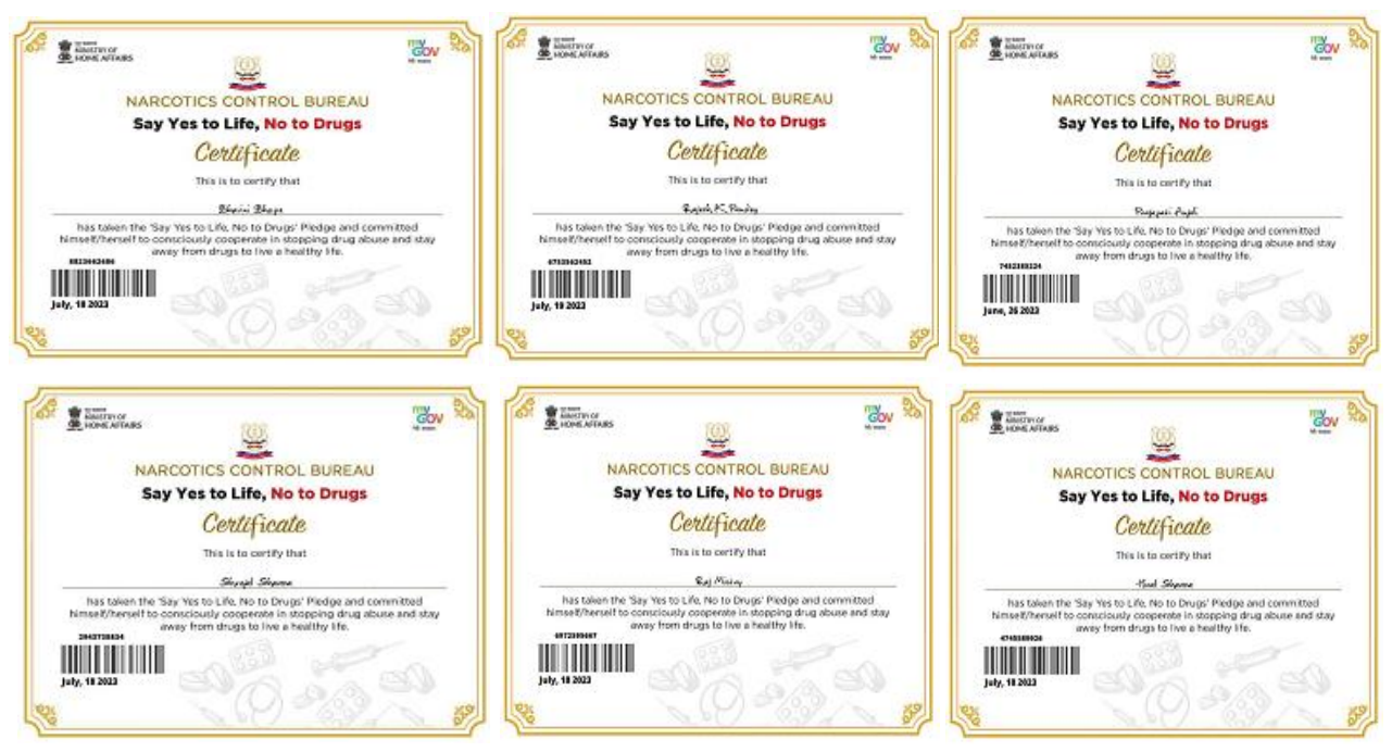
SSR IMR Family aims to inculcate good habits in its students

Today we pledge that we will stay away from drugs and live a healthy life.